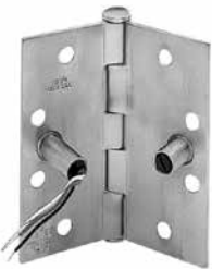
CSCB179 CSCB168 CSCB191 CSCB199 5-Knuckle Concealed Bearings