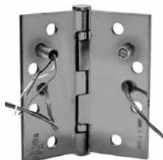
5-Knuckle Ball Bearings