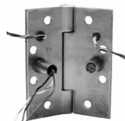
3-Knuckle Concealed Bearings