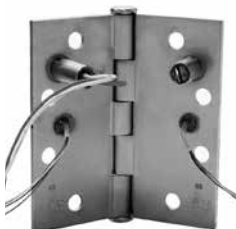
5-Knuckle Concealed Bearings

Hinges may be equipped with both concealed wires and concealed switch. When both are desired use prefix CECS. Specify hand.