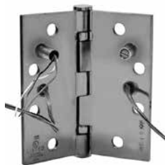
5-Knuckle Ball Bearings