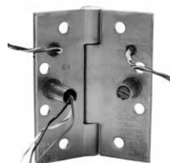
3-Knuckle Concealed Bearings